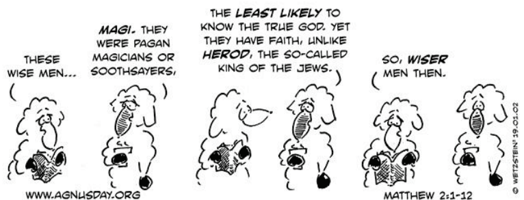
"Agnus Day appears with the permission of www.agnusday.org "

(From catholic-resources.org/Bible/Biblical-Mass-Texts and catholic.com/magazine/print-edition/the-mass-is-profoundly-biblical )